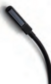
Cardiac P10 Probe: Phased Array

**compatible with the 6LE5Vs transrectal probe for large animal work